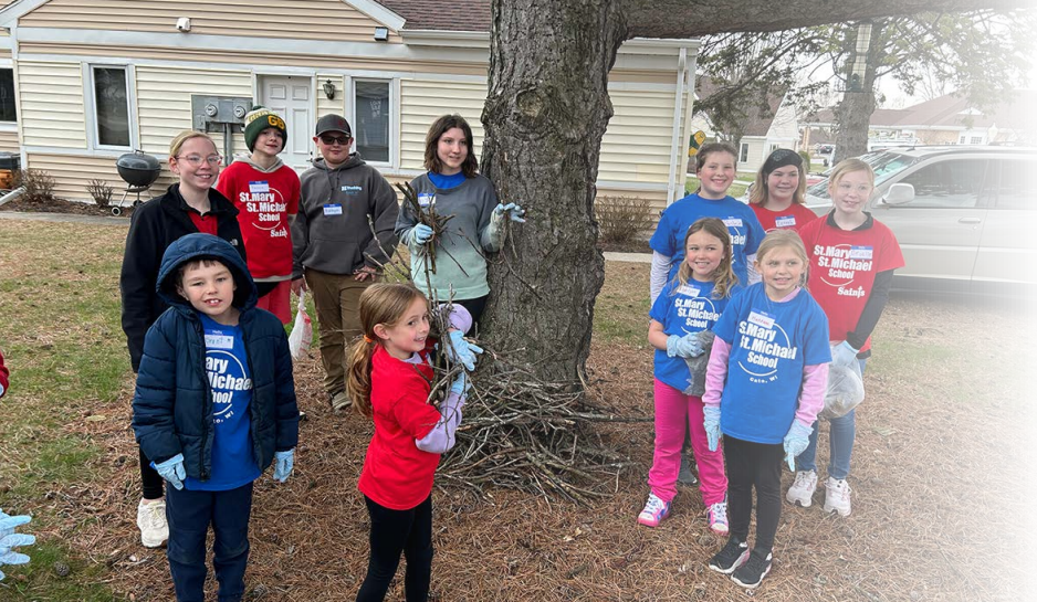
Children from St. Mary/St. Michael School, Clarks Mills visited Felician Village for Mass, followed by a social with residents. The kids did a great job picking up trash around the grounds, sharing a meal and conversation with residents and presenting an earth day creation.