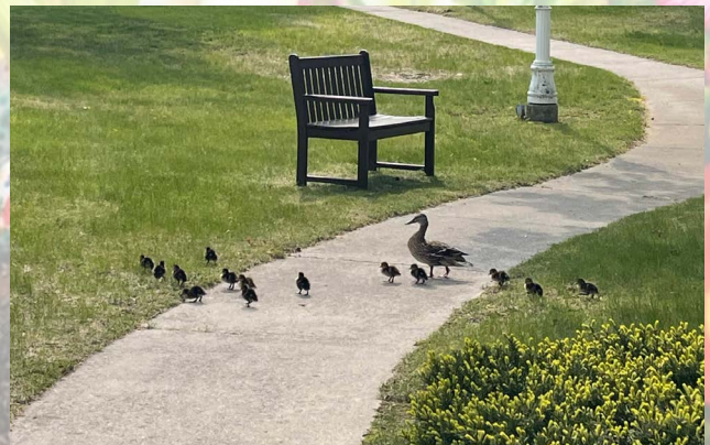
Mama duck and her ducklings waddling around The Gardens courtyard.