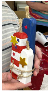
A perfect craft and decor for the month of July!