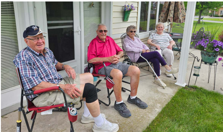
Gardens residents enjoying each other's company on their beautifully decorated patios.