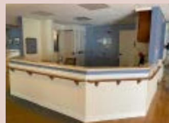
Construction done by Hamann Construction, Inc.

Our donors are so amazing! We have even more donor stories to share with you on the Felician Village website.