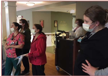
St. Mary's Home caregivers being trained on the bladder scanner.

This past year we had some very special donor funded opportunities for equipment, entertainment, and education. Nursing had a need for a bladder scanner. This new scanner which is attached to a mobile device, can be used in the privacy of the resident's room, often sparing the person a trip to the doctor's office. A caregiver applies the wand of the scanner over the bladder, which detects levels of urine in the bladder as a prophylactic or real-time measurement. The results are highly effective in determining a bladder infection and reducing catheter-associated urinary tract infections (CAUTIs).