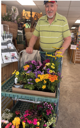
The Court bus trip to Hartmann's Towne & Country Greenhouse

have been possible without the incredible support of our community, from the unforgettable Mrs. Roper's Romp fundraiser, to generous grants, individual donors, passionate supporters, and countless hours of dedication behind the scenes. Thank you to everyone who helped bring this vision to life.